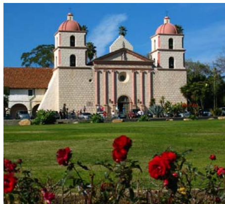
Historic Mission Santa Barbara

A full buffet breakfast is provided at Marisol at The Cliffs Restaurant this morning. After breakfast we'll embark on a self-guided tour of the La Purisima Mission near Lompoc - the only example in California of a complete mission complex - and afterward stop by The Luffa Farm, one of the only growers of luffa sponges in the USA. Then we head onward to lunch at the Spyglass Inn Restaurant. This afternoon visit the Monarch Butterfly Grove on Pismo Beach where you'll learn about the Monarchs from a park docent as thousands of vibrant butterflies flutter around you. Later you'll have time to relax and freshen up at the hotel and have dinner on your own before enjoying an exciting show at The Great American Melodrama & Vaudeville Theatre. [B, L]