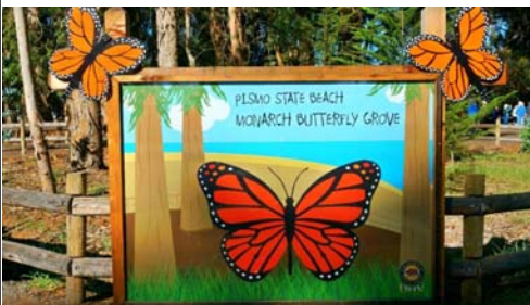
Pismo Beach Monarch Butterfly Grove

We depart San Diego early morning and journey north along some of California's most beautiful coastal areas en route to Santa Barbara, where you'll have time to explore Stearns Wharf and enjoy lunch on your own. In the afternoon we'll visit the historic Santa Barbara Mission before continuing on to Pismo Beach, where you'll settle in for a two-night stay at The Cliffs Resort. Perched atop bluffs overlooking some of the world's most pristine beaches, the Cliffs is an award-winning resort that will have you dazzled by its exquisite details. This evening, enjoy a delicious welcome dinner at F. McLintocks Saloon & Dining House. [D]