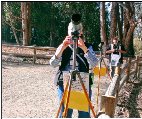
A closer look at the Monarchs