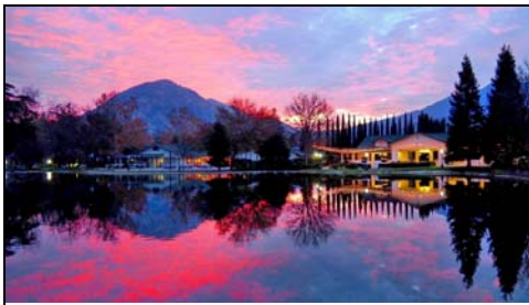
Wonder Valley Ranch Resort